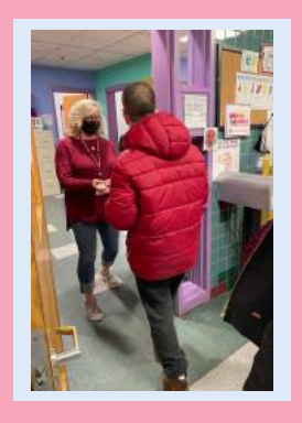
Delivering Sugar Shack Valentine goodies to other schools in the District